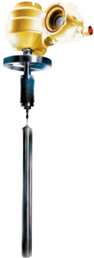
Mobrey MLT100 Transmitter With Optional Display Fitted