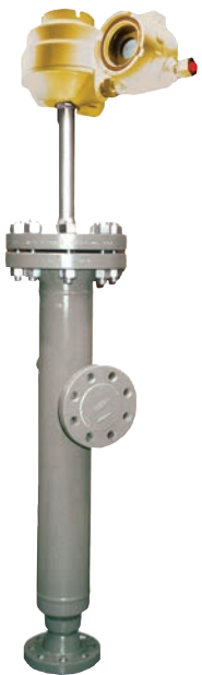
Mobrey MLT100 Transmitter in a Side-and-bottom Chamber

The Mobrey MLT100 Level Transmitter is one of the most advanced displacer based devices on the market, coupling the time proven buoyancy principle with state of the art electronics in an instrument of high reliability and stability.